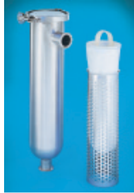
Models 4 and 8