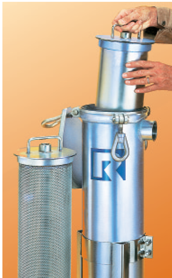
An SP-style basket being put into a Rosedale Model 8-30 vessel. An RS-style basket is in the foreground.

Activated Carbon Packs are pre-measured amounts of 20 x 50-mesh-size activated carbon, packaged to protect against moisture. A universal grade of carbon is used, offering good flow rates.